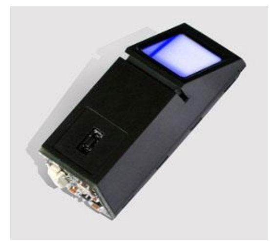
Fig 2. Fingerprint sensor SM630

Perfect Technical Support: Miaxis is the leading company in the fingerprint verification industry. It has an excellent customer service team ready to offer powerful technical support in user development.