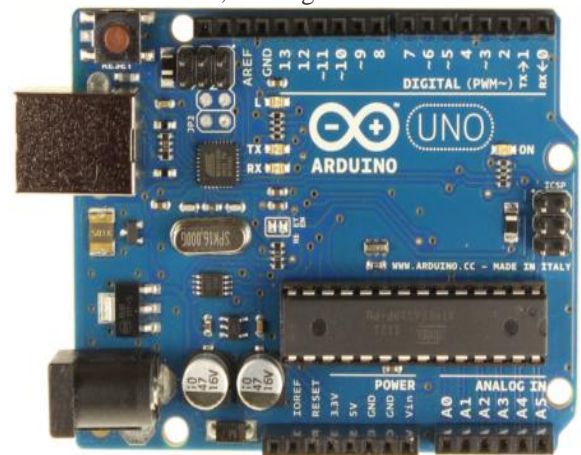
Fig. 3.ARDUINO UNO

The Uno differs from all preceding boards in that it does not use the FTDI USB-to-serial driver chip. Instead, it features the Atmega8U2 programmed as a USB-to-serial converter. "Uno" means one in Italian and is named to mark the upcoming release of Arduino 1.0. The Uno and version 1.0 will be the reference versions of Arduino, moving forward.