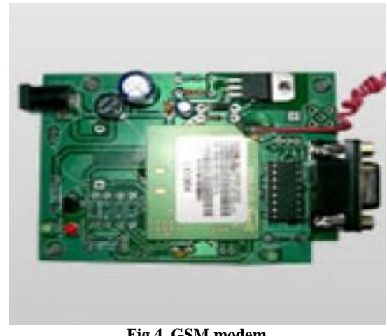
Fig 4. GSM modem